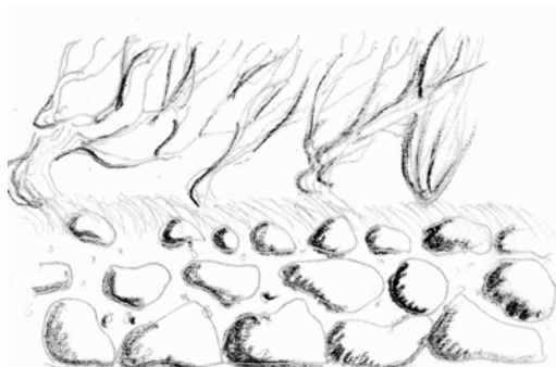
Some Enclosure Acts demanded hedges on lower ground, grown on raised beds, supported by rocks, to keep tree roots from the waterlogged ground and fenced by wooden rails – all paid for by the new tenants of course!

As for the roads, around the villages, they follow the path created by earlier, haphazard enclosure of land by cottages, but the ones on the land mapped by the Enclosure Acts followed straight lines drawn on a map and were designed to allow horse drawn wagons to carry stone from the quarries to where the walling gangs needed it, or lime to improve the acid soil or just to 'drove' stock.